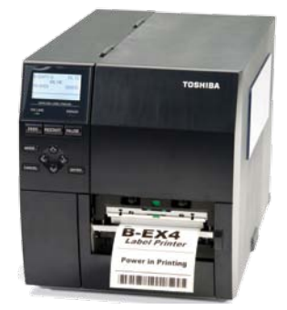
B-EX4 a superior range of industrial printers at midrange price for a wide variety of applications