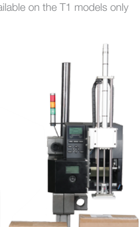
00 · Labeling in motion, different sizes up to 30 labels per minute