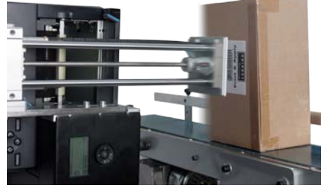
Versatile, applying labels top, bottom or sides at any rotation